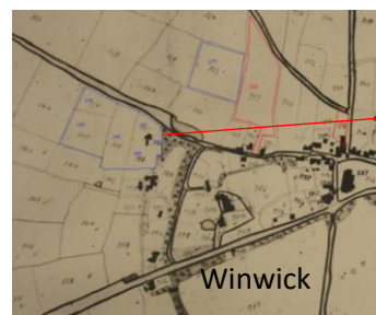
Tithe Plan 1835