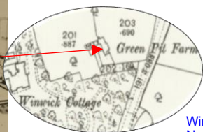
Winwick Map 1893 National Library of Scotland archive